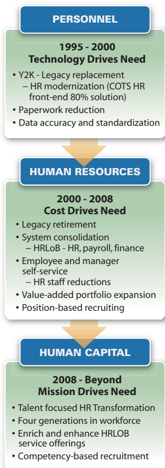
Human Capital Transformation

People are your greatest asset. Empowering that asset is even more critical in today's workforce comprised of four generations of talent. As a thought leader in Human Capital Management, Northrop Grumman is poised to be your strategic partner in today's rapidly changing environment. When business is the driver, mission is your focus, and technology is the enabler, your talent will be empowered.